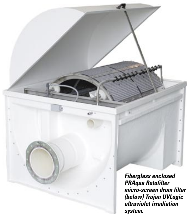
Fiberglass enclosed PRAqua Rotofilter micro-screen drum filter (below) Trojan UVLogic ultraviolet irradiation system.

One of the special requirements of the pilot- and full-scale projects was that no untreated water was permitted to pass the disinfection system. This is essential if the supply water is known to contain pathogens. A simple solenoid valve can stop flow during power outages, but a more sophisticated way of preventing passage of contaminated water is by incorporating an uninterruptible power supply (UPS) in to the UV control system, and interlocking it with actuated valving. By bridging the transfer