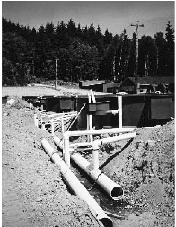
Tank field piping under assembly and before backfilling.

System design services can be obtained from third party consultants, and may be wrapped into sales contracts for specified equipment or